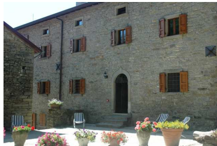
RIFUGIO I DIACCI